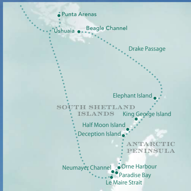
Planned Antarctic Route